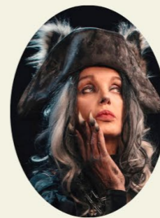
Arielle Dombasle The Wolf