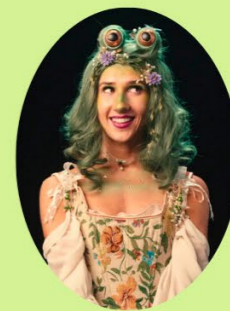
Marie S'infiltrer The Frog