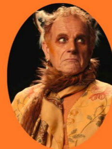
Charles Berling The Fox