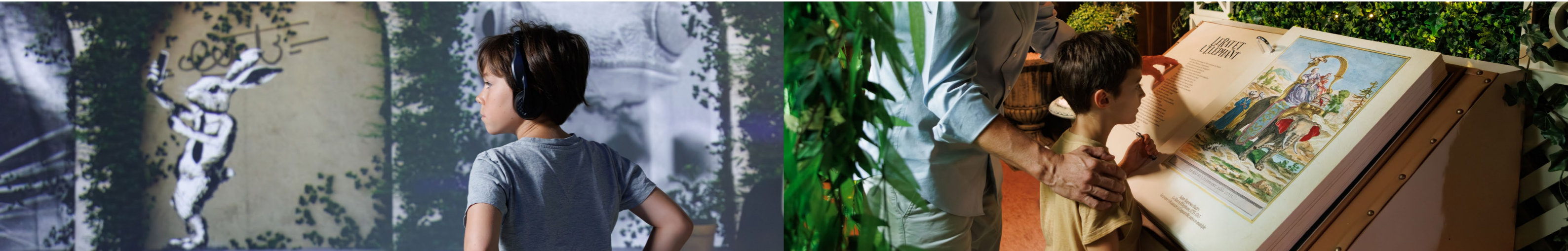
Hall of dreams