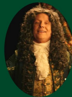
Laurent Stocker Jean de La Fontaine